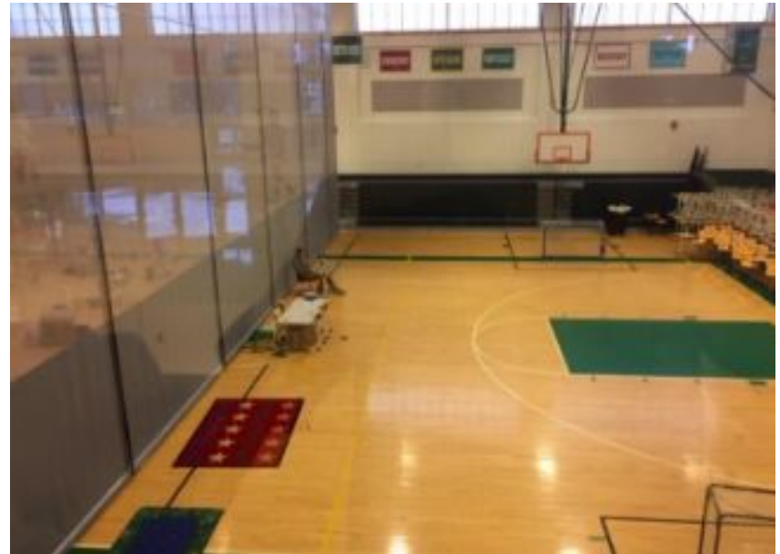
One half used for gym classes.