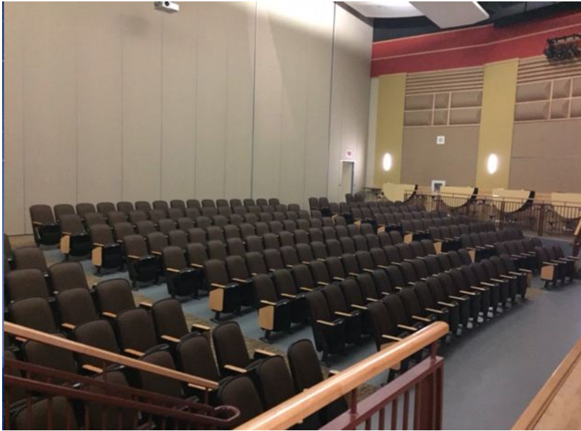
Middle School Overflow Space