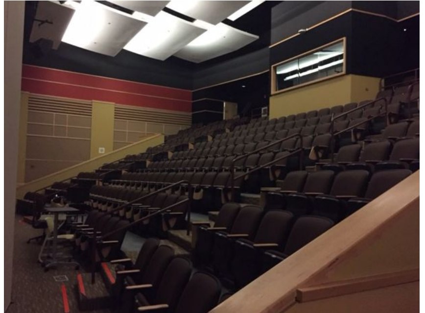
High School Overflow Space