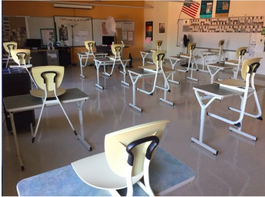
Middle School Classroom