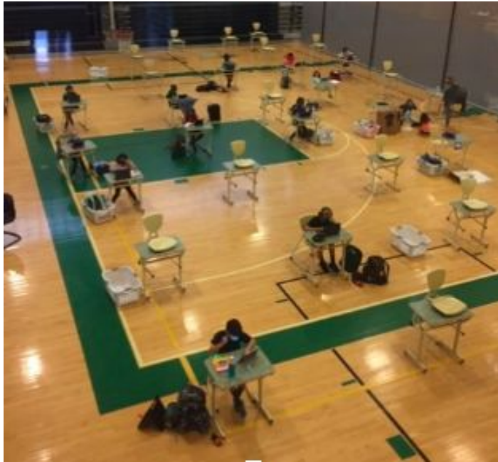
45 seats - shared with the High School. Note: Desks in this image are greater than 6' apart.