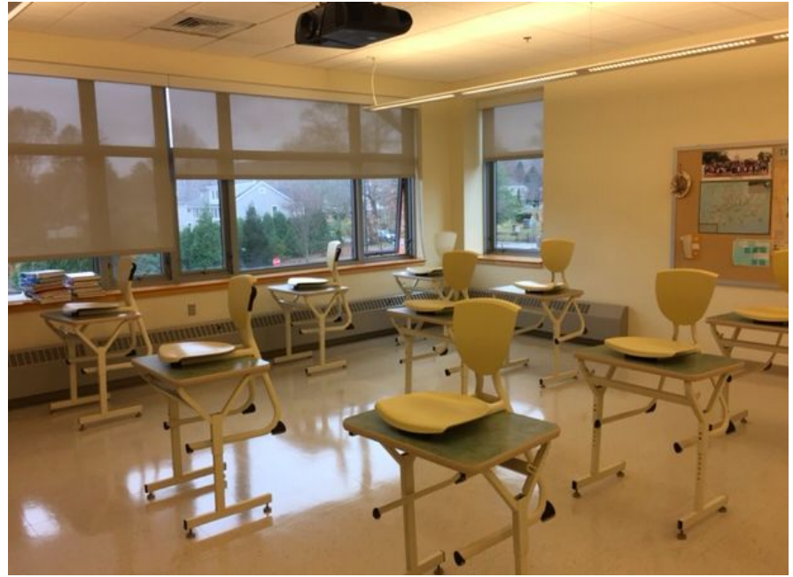
High School Classroom